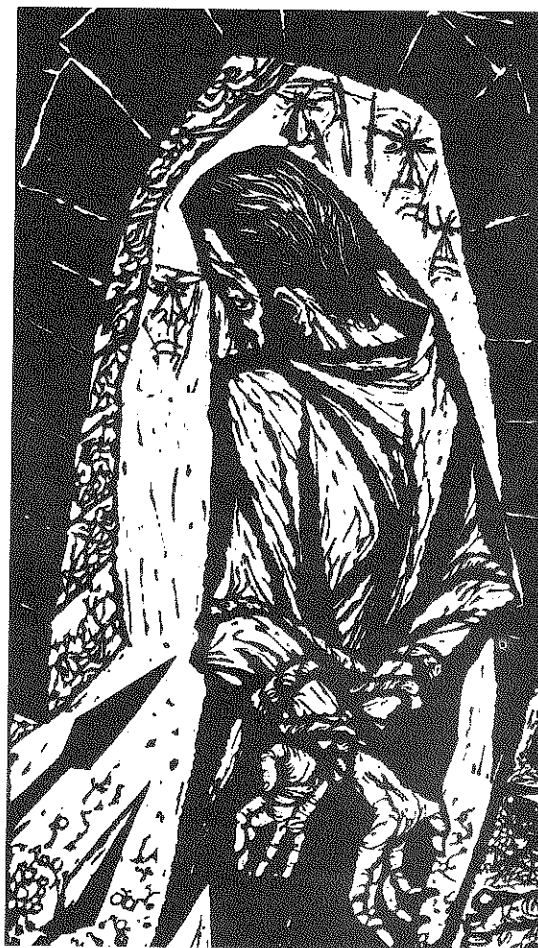
The Denial (linocut)

He was sitting with the guards, warming himself at their fire. Dusk turns to deep night. The howls of pain from inside have stopped. A prevaricatory court has convened, and imperial justice